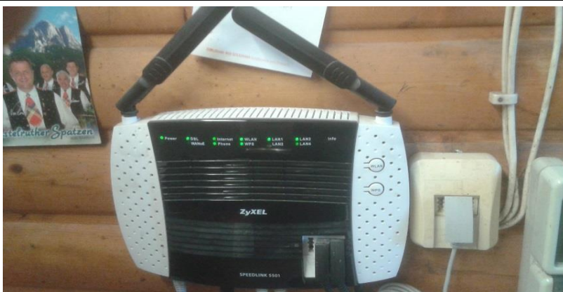
Nr. 23003 ZyXel-Router