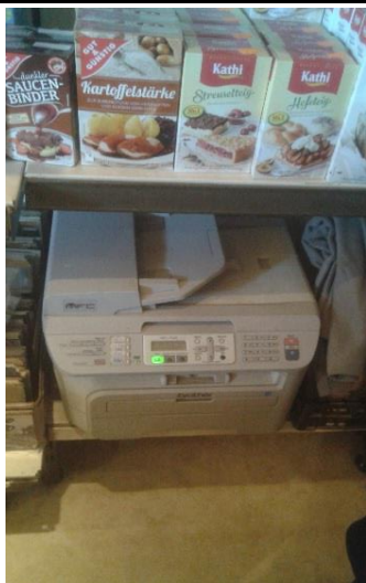
Nr. 23002 Fax brother MFC